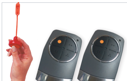
Easy Access Transmitter and Two TrioCode™ 128 Remote Controls