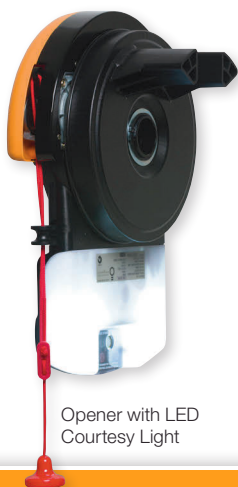
Opener with LED Courtesy Light