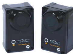
Wired Safety Beams